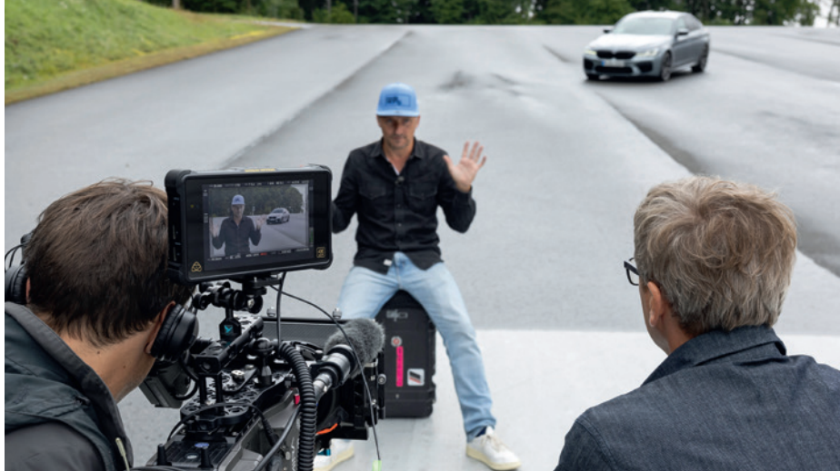
Photo- & Filmset